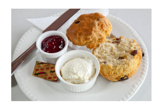
Please see our cabinet for all other Cakes and delicious Desserts